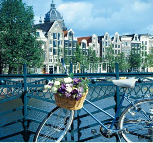
Amsterdam's charming bridges and picturesque canals bring the intimacy of a small town to one of Europe's most celebrated cities.

RESPONSIBILITY: Thomas P. Gohagan & Company, the sponsoring associations/organizations, and its and their employees, shareholders, subsidiaries, affiliates, officers, directors or trustees, successors, and assigns (collectively "Gohagan"), do not own or operate any entity which is to or does provide goods or services for your trip including, for example, lodging facilities, airline, vessel, or other transportation companies, guides or guide services, local ground operators, providers or organizers of optional excursions, food service or entertainment providers, etc. All such persons and entities are independent contractors. As a result, Gohagan is not liable for any negligent or willful act or failure to act of any such person or entity or of any other third party.