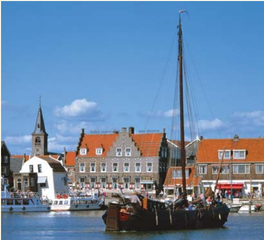
Step back in time in the charming port of Volendam, a traditional Dutch fishing village.

A national monument and a UNESCO World Heritage site, Holland's greatest concentration of traditional windmills provides an opportunity to see firsthand the internal workings of an authentic windmill. Little has changed here since the mid-18 th century, when 19 tall, wooden windmills were erected side by side at Kinderdijk to drain the Alblasserwaard, one of many regions in The Netherlands located below sea level. Though no longer used to monitor water levels, the windmills are still one of Holland's most picturesque sights and represent examples of the exceptionally advanced achievements of 18 th -century Dutch engineering.