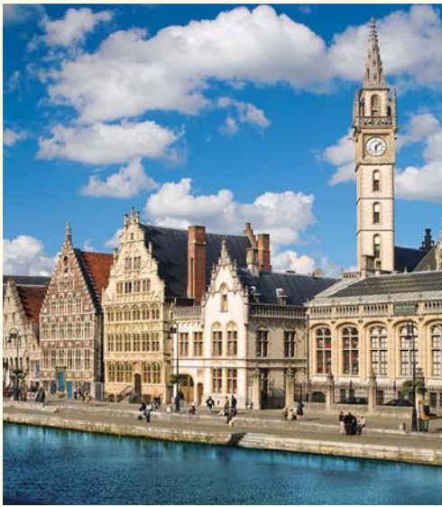
Ghent's medieval harbor, Graslei is known for its beautifully intricate, well-preserved guildhall façades.