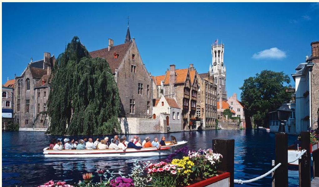
On your canal cruise of UNESCO-designated Bruges, discover the city's medieval architecture and look for the landmark 13 th -century belfry, which houses a 48-bell carillon and employs a full-time carillonneur to play it.

Quaint 18 th -century houses, historic canals and a picturesque waterfront typify the beauty and charm of the Dutch fishing port of Volendam, where many residents still don the traditional dress of the region. Built along the top of a dike, the village's primary thoroughfare is lined with purveyors of fresh fish, handmade cheeses and a myriad of traditional crafts.