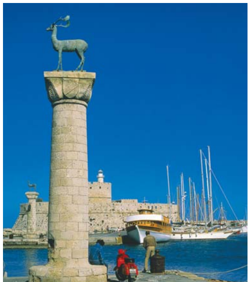
The bronze stag symbolizes the Colossus of Rhodes, one of the Seven Wonders of the Ancient World.

P.S. University of Florida Alumni Association members will receive a gift placed in their room as a token of our appreciation. To join the UFAA, call 888-352-5866 or email ufalum@uff.ufl.edu .