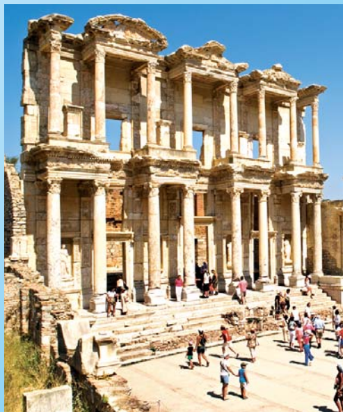
The monumental Library of Celsus, Ephesus, was a repository for more than 12,000 scrolls 1800 years ago.

This legendary metropolis straddling the Bosphorus Strait is the only city in the world that naturally bridges two continents: Europe and Asia. Its historic treasures are designated a UNESCO World Heritage site and include the magnificent Hagia Sophia, Topkapi Palace and the Blue Mosque.