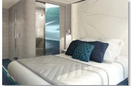
Stateroom with Balcony

The state-of-the-art propulsion system and custom-built stabilizers provide an exceptionally smooth, quiet and comfortable voyage by minimizing vibration and engine noise. By design, the ship is energy efficient and environmentally protective of marine ecosystems. The ship has two tenders.