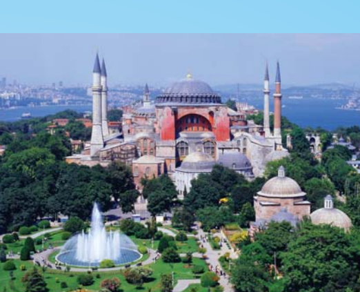
Istanbul's Byzantine Hagia Sophia was built in a remarkably short six years by Emperor Justinian I.

to be the legendary lost city of Atlantis. A cable car descends to sea level from the elevated town of Fira, whose stunning white-walled buildings stand in stark contrast against the dark volcanic cliffs.