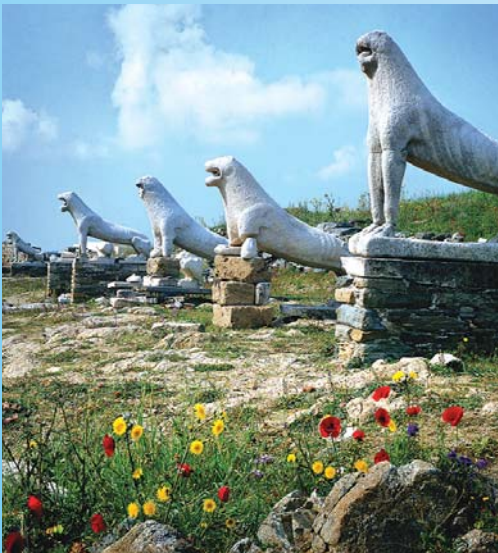
The magnificent ruins of Delos feature the famed Terrace of the Lions, masterfully crafted in 600 B.C.

Be on deck as the ship cruises into the spectacular harbor at Santorini, a naturally created caldera, beneath which is believed