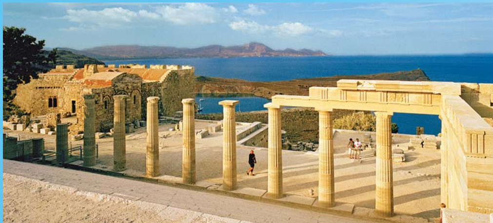
The archaeological ruins of the Acropolis of Lindos bear the marks of the Greek, Roman, Byzantine and Ottoman civilizations that thrived on the island of Rhodes. Inset above: The incomparable Parthenon on the Acropolis of Athens.

Scheduled guest speaker may be altered due to circumstances beyond our control. See Release of Liability, Assumption of Risk and Binding Arbitration Agreement.