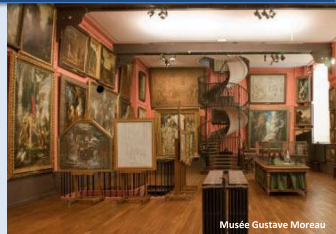
Musée Gustave Moreau