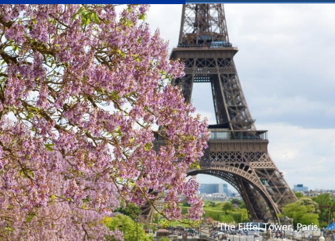
The Eiffel Tower, Paris