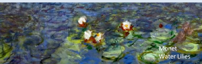
Monet Water Lilies

Overnight: Le Meurice , Paris. Perfectly located near the banks of the Seine just minutes from the Louvre, Le Jeu de Paume, Le Musée d'Orsay and the finest shopping along the Rue de Rivoli.